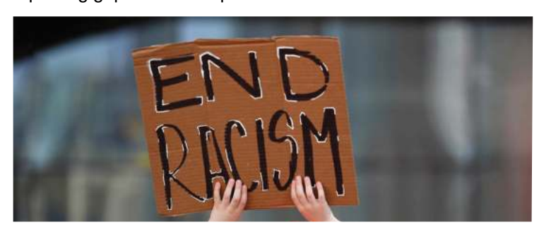
Figure 9: Battling divid e: Rooting out injustice requires collective will of society, whether it is racial bias in the US or caste and communal considerations in India (The Tribune, n.d.).

uncover perpetrators' motives. Law enforcement officials can also design and carry out hate crime victimization surveys with hate-crime specific questions. Eventually this mechanism will allow law enforcement and policy makers to understand the reporting gap and develop measures to address it.