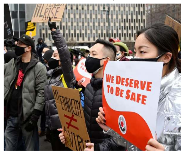
Figure 10: People protest against a recent uptick in hate crimes targeting Asian Americans in New York's Manhattan on Feb. 27, 2021 AP photo by (Kyodo, 2021).

It is strongly recommended to offer training and capacity-building initiatives for both community-based and law enforcement groups (interfaith, intrafaith, and specific training on how to detect hate incidents and crimes early and how to report and act on hate incidents and hate crimes. To this end, CEWAP encourages cities and States and/or the Federal Government to embark on the following activities: