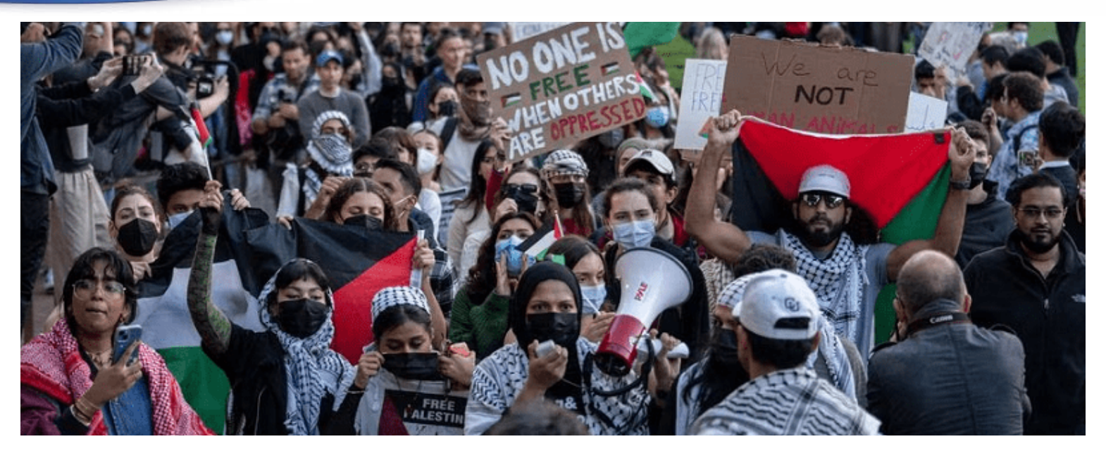
Figure 5: Pro-Palestinian students take part in a protest in support of the Palestinians amid the ongoing conflict in Gaza, at Columbia University in New York City, US, on October 12, 2023

In a 1988 study, researchers found a correlation between the burning of crosses and the activation of White supremacist groups (Green & Rich, 1998). Similarly, a 2014 study found that the number of White hate groups was a significant predictor of the presence of violent far-right perpetrators at the county level (Adamczyk et al., 2014).