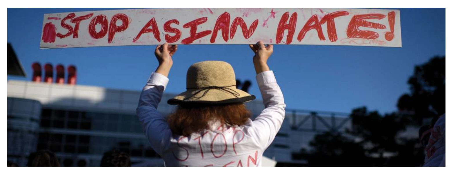
Figure 6: What your Asian employees need right now.

Anderson Lee Aldrich shot and killed five people at Club Q, a nightclub for the LGBTQ+ community in Colorado Springs, on November 19-20, 2022 (The Associated Press, 2022). On the night of the shooting, it was reported that Aldrich had purportedly established a website that promoted "free speech" but also contained violent and racist content. Among the disturbing material was a video that suggested the elimination of civilians to "purify society" (Yurcaba & Collins, 2022).