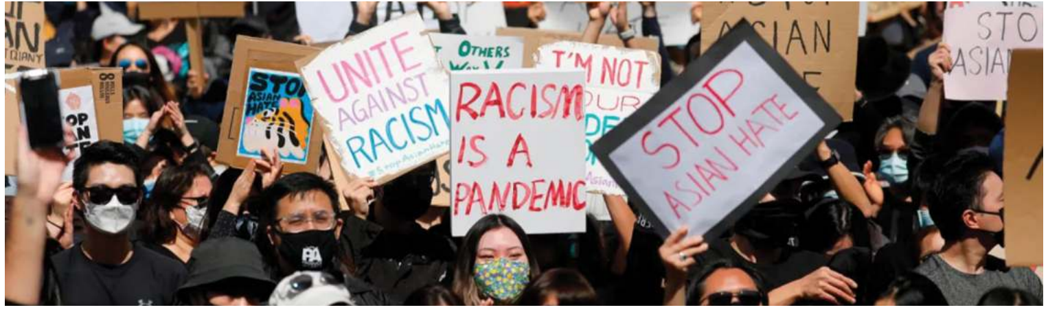
Figure 3: Protesters attended a "#StopAsianHate Community Rally" in downtown San Jose on Mar. 21, 2021