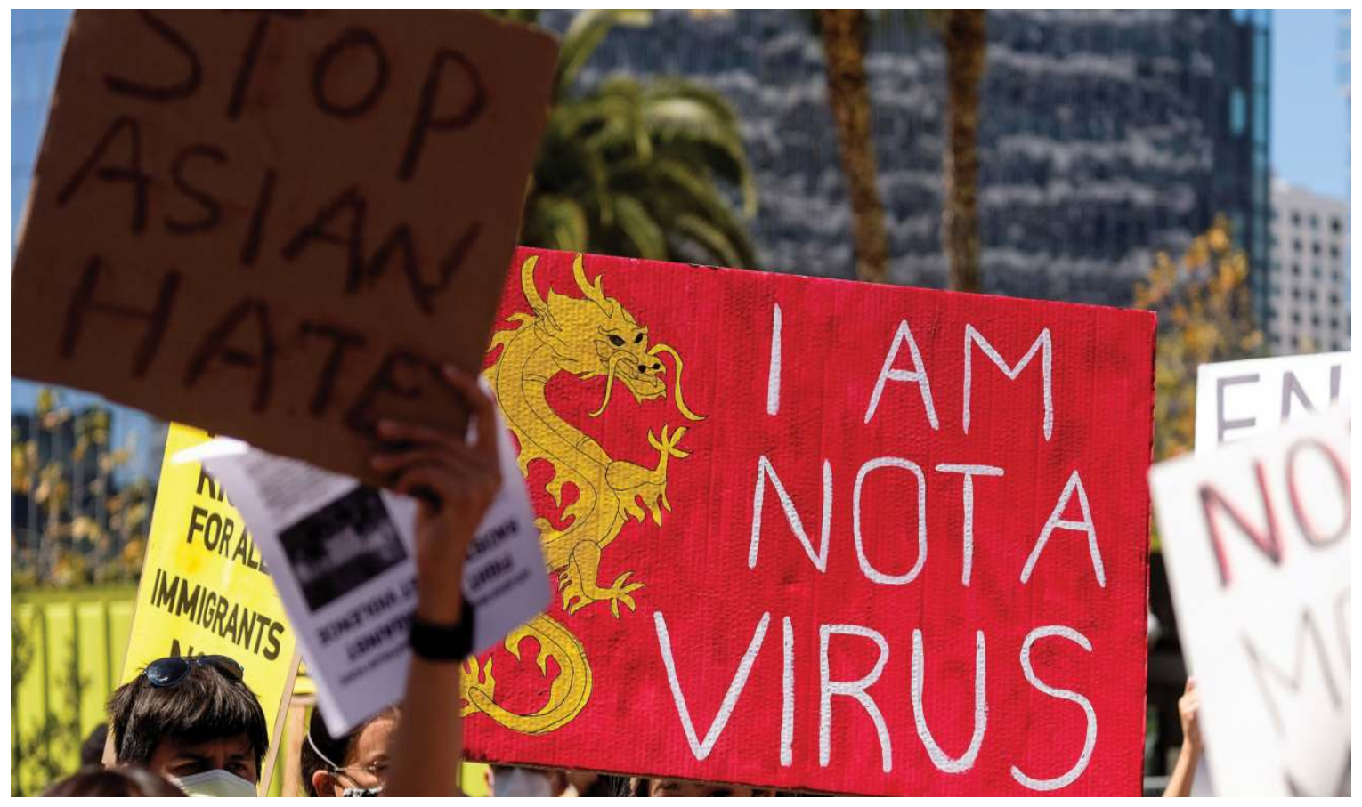
Figure 2: Demonstrators holding signs during a rally against anti-Asian hate crimes outside City Hall in Los Angeles on March 27 (Chiu, 2021).

Hate is rooted in and develops from the human tendency to differentiate between us and them and the ways that people come to devalue them (Staub, 2005). Examples of such differentiation have been race, religion, ethnicity, nationality, social class, and political beliefs. According to Stab (2005), a common form of devaluation is to see them as unintelligent, lazy, and unappealing. A more extreme form is to see the "Other" as morally deficient and evil, which is often accompanied by the belief that the other has gained wealth, power, or influence dishonestly, manipulatively, and at one's own expense, as seen in the devaluation of Jews. Another form of devaluation is viewing the "other" as a danger to his or her life, loved ones' lives, or the lives of members of his or her group. For example, Hitler and the Nazi propaganda promoted the idea that Jews were a threat to Germans individually (exploiting them, seducing German