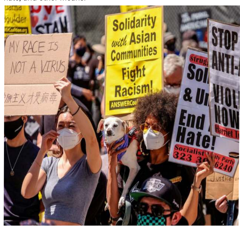
Figure 1: U.S. protest against hate crimes

Federal agencies like the Department of Homeland Security (DHS), state and city public safety offices, and religious congregations and other civic groups should redouble their efforts to help individuals and communities recover from hate crimes and hate group activities through funding for healing programs, increased community policing, restorative approaches, community dialogue, interfaith campaigns, human rights campaigns, legislative actions, community listening sessions, regulations limiting hate, and other means.