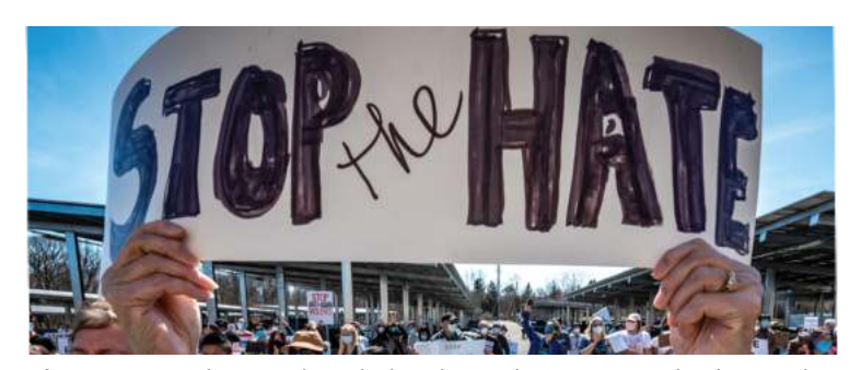
Figure 7: Hate Crimes Against Black, Asian, and LGBTQ+ People Hit Record Highs in 2020 (Getty Images, 2021).

Hate crimes and incidents are symbolic messages to society about the worthiness of certain groups of people. As a result, hate crimes have a damaging effect, not just on individual victims, but on other members of an identity group. The reporting of hate violence by local and national media helps to promote a message of danger, which in turn creates a climate of fear among minority communities. This means that a single act of targeted violence can result in an entire community experiencing a heightened sense of vulnerability. A major concern that arises from the symbolic nature of hate crimes is that they give rise to the potential for minority groups to "fight back." Many researchers note that hate crimes can pose a potential risk to social order as identity groups seek to establish justice. Isolated incidents spark angry responses from members of the targeted group who seek to defend their "in-group."